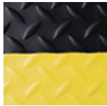
Black Yellow Border